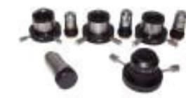
Phase and Dark Field

The LW Scientific I-4 microscope features exceptional optical quality with an infinity optical system, like found on the most expensive laboratory microscopes, but at a fraction of the price. The ergonomic narrow design allows users to rest their arms flat on the table and easily operate all controls. The binocular head also can be rotated to the top for an additional 2 inches of height for taller users. Optional LED lighting produces "daylight" color, with a cool temperature and long life. Comfort, durability, dependability, and superior imaging make the I-4 a great value for labs, physicians, vets, and universities.